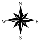
Figure 6.14 - REGIONAL MUNICIPALITY OF NIAGARA - 2002 Property Tax Information by Area Municipality (Local General Levy only)